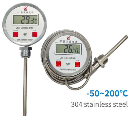
-50~200°C 304 stainless steel