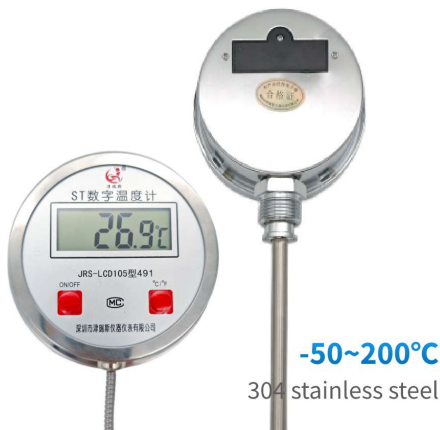
-50~200°C 304 stainless steel