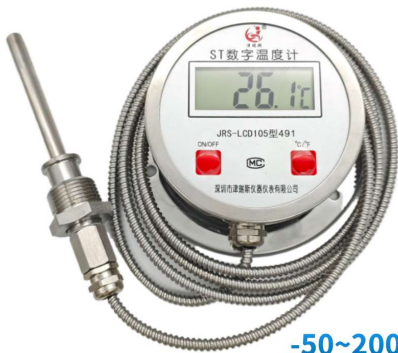
-50~200°C 304 stainless steel